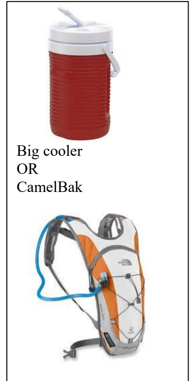
Big cooler OR CamelBak

Getting Ready - Marching Band is a physically demanding discipline. You need to be in healthy and in shape! We will stretch, we will run, we will do push-ups, and more! I recommend getting 30 minutes of exercise a day leading up to camp. You need to have strong shoulders, back, and core for us to look our very best! Go outside to be prepared for the heat. STAY HEALTHY!!!!